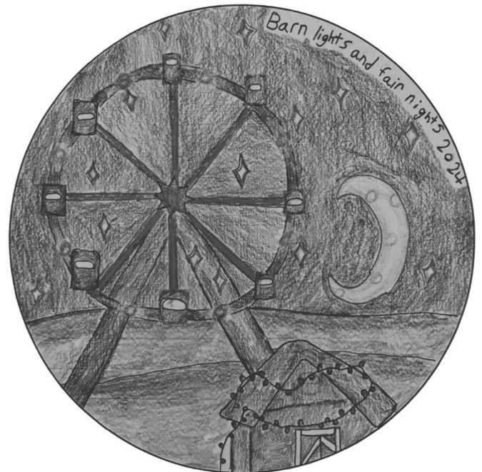
Fair button design drawn by Owen Archer.