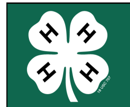
White with Black H's.