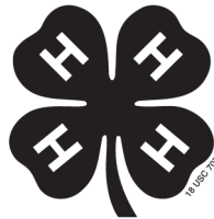
Black with White H's.